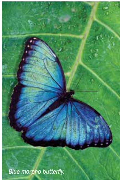
Blue morpho butterfly.

After an early breakfast at the hotel transfer to Carara National Park, where the less dense rain forest makes for easy bird sightings. Enjoy lunch at a local restaurant before venturing to the nearby Bat Jungle exhibit or hearing from an early Quaker settler of Monteverde. We'll check into a family-owned retreat with expansive lawns and picturesque views of the cloud forest. (B,L,D)