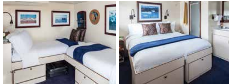
Insets clockwise from top: Expedition ship National Geographic Sea Lion can access hard to reach locations; twin beds can be pushed together to form a double bed in Category 3 cabins on the Upper Deck; a comfortable Category 2 cabin.

CATEGORY 1: Main Deck #300-305—Conveniently positioned between the dining room & lounge, these cabins feature two single lower beds, a writing desk, and a large view window.