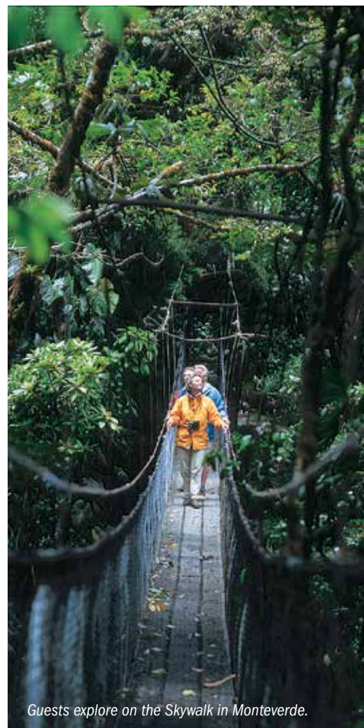
Guests explore on the Skywalk in Monteverde.

A scenic drive of approximately five hours takes us to Monteverde Cloud Forest, an acclaimed private reserve. Bathed in cool, year-round moisture, the forest is covered with mosses and 300 species of orchids. Walk trails rich with butterflies and bird life. Ascend the Skywalk, a series of suspension bridges, for a bird's-eye view of the rain forest canopy. Learn about life