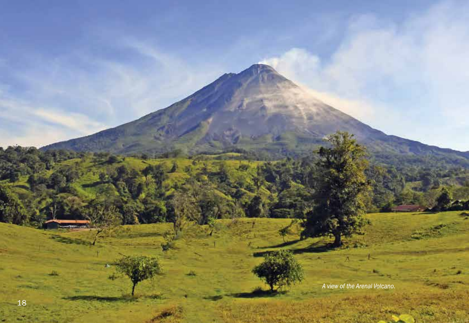
A view of the Arenal Volcano.