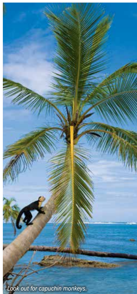
Look out for capuchin monkeys.

DATES: 2015 Dec. 11, 25 2016 Jan. 8, 22; Feb. 5, 19; Mar. 4, 18