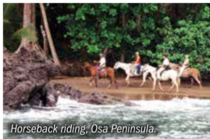
Horseback riding, Osa Peninsula.

Spend the morning in Manuel Antonio National Park, a UNESCO World Heritage site, where thick forests fringe white-sand beaches. Watch for three-toed sloths lazing among the branches, and spot monkeys and vividly colored birds. This afternoon follow the Pacific coastline south and stop for a refreshing swim or a hike. (B,L,D)