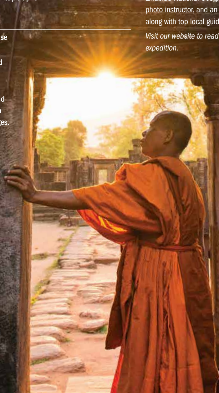
Monk at Banteay Srei temple.

Visit our website to read staff bios for this expedition.