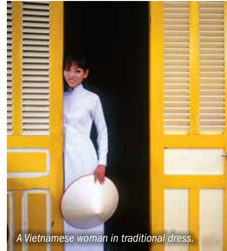
A Vietnamese woman in traditional dress.

You'll travel in the company of a Lindblad expedition leader and well-informed local guides, and you'll learn a great deal about the many things you see.