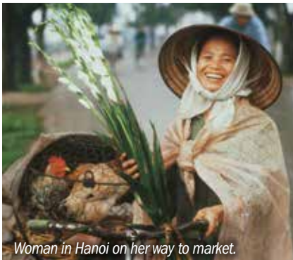
Woman in Hanoi on her way to market.

This morning, visit market stalls and help buy produce. Then take a boat to a cooking school, for a hands-on cooking class, later dining on the dishes you've prepared. There is time this afternoon for further exploration on your own, and you may wish to have dinner at a local restaurant. (B,L)