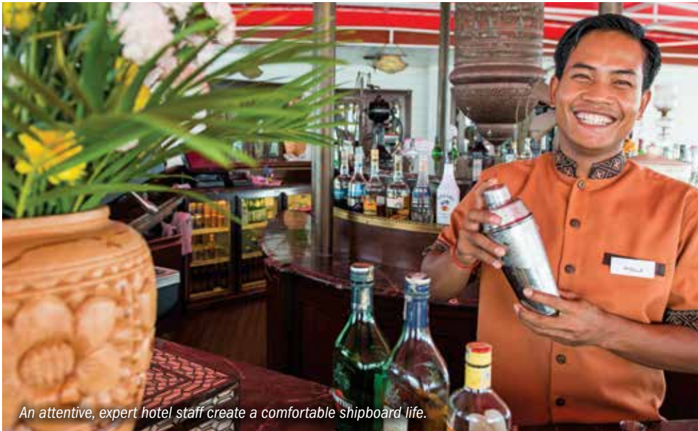
An attentive, expert hotel staff create a comfortable shipboard life.

Aboard Jahan, experience a level of luxury not previously found on the Mekong River. This 48-guest ship provides access to places that would otherwise be difficult to reach, with a standard of accommodation and service that ensures a more than comfortable base for resting and dining after days of exploring. Jahan's cabins are extremely spacious, and each has a private balcony ideal for taking in river views.