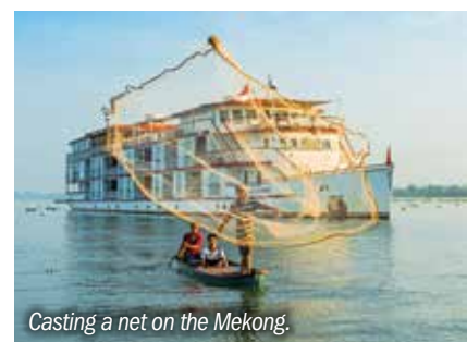
Casting a net on the Mekong.