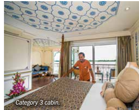
Category 3 cabin.

Aboard Jahan, experience a level of luxury not previously found on the Mekong River. This 48-guest ship provides access to places that would otherwise be difficult to reach, with a standard of accommodation and service that ensures a more than comfortable base for resting and dining after days of exploring. Jahan's cabins are extremely spacious, and each has a private balcony ideal for taking in river views.