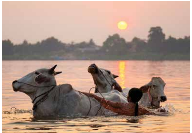
Clockwise from top: Boats carrying rice in the canals around Vinh Long, Mekong Delta; Girl bathing cows in the Mekong; Happy Cambodian girl.