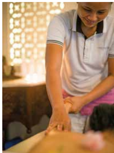
Left: the Apsara Spa offers a choice of relaxing treatments.