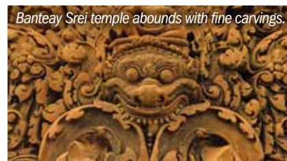
Banteay Srei temple abounds with fine carvings.

Embark on a tour of Saigon's landmarks, including the Reunification Palace, headquarters of the South Vietnamese government during the Vietnam War. This evening, connect with your return flight home, arriving on Day 14. (B)