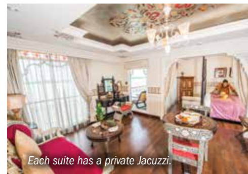
Each suite has a private Jacuzzi.