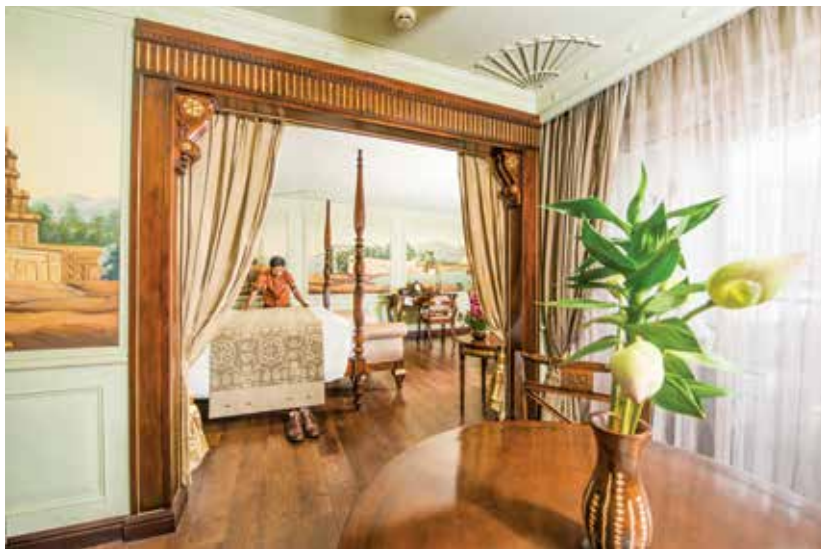
Above and right: The two royal suites are the largest and finest accommodations aboard. Each features a private Jacuzzi and spacious living areas.

» TO LEARN MORE ABOUT JAHAN , VISIT WWW.EXPEDITIONS.COM/JAHAN