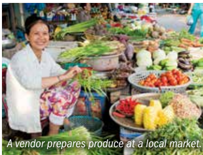
A vendor prepares produce at a local market.

Rise early to watch the sunrise over Angkor Wat. This 12th-century Khmer temple, one of the world's largest religious monuments, is adorned with elaborate bas-reliefs and sculptures. Ride a tuk-tuk , or motorized rickshaw, to the walled city of Angkor Thom. Discover the shrines of Ta Prohm and the temple of Banteay Srei. Visit a workshop where local youth are trained in age-old Khmer arts. (B,L,D; B,D)