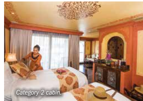
Category 2 cabin.