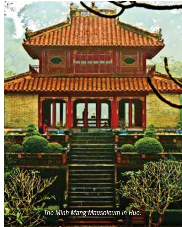
The Minh Mang Mausoleum in Hue.

Drive to Halong Bay and board the outstanding Halong Ginger or Halong Jasmine , built in the style of a junk, for an overnight sail on the bay. See the dramatic limestone peaks for which the region is famous. Cruise among them and enjoy the myriad formations. Take a short trek to a nearby summit for a panoramic view of the bay, or sunbathe on the deck. Spend the night aboard ship. (B,L,D)