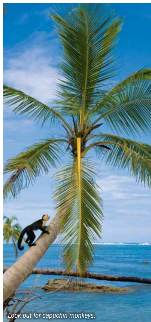
Look out for capuchin monkeys.