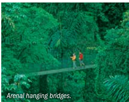
Arenal hanging bridges.

a fresh perspective on the volcano. Dine at a restaurant on the lake's far side before checking into an elegant hotel surrounded by gardens and pastures with grazing animals. Every room offers a panoramic view of the smoldering Arenal Volcano. (B,L,D)