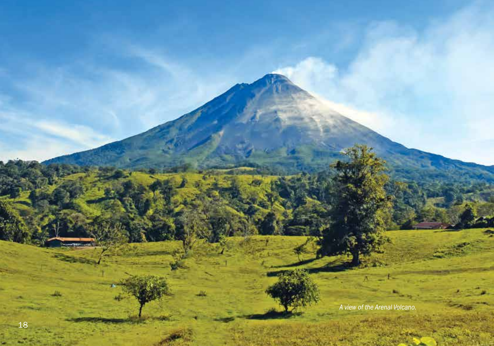
A view of the Arenal Volcano.