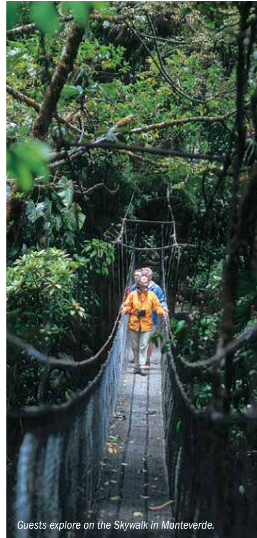
Guests explore on the Skywalk in Monteverde.

A scenic drive of approximately five hours takes us to Monteverde Cloud Forest, an acclaimed private reserve. Bathed in cool, year-round moisture, the forest is covered with mosses and 300 species of orchids. Walk trails rich with butterflies and bird life. Ascend the Skywalk, a series of suspension bridges, for a bird's-eye view of the rain forest canopy. Learn about life in the early Monteverde community from Marvin Rockwell, one of the original Quaker