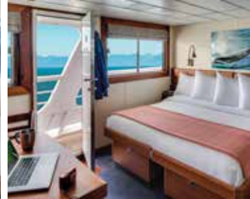
Insets clockwise from top: Expedition ship National Geographic Sea Lion can access hard to reach locations; twin beds can be pushed together to form a double bed in Category 3 cabins on the Upper Deck; a comfortable Category 2 cabin freshly redesigned.

NOTE: Sole Occupancy cabins are available in Categories 1 and 2 only. Third person rates are available in certain categories at one half the double occupancy rate.