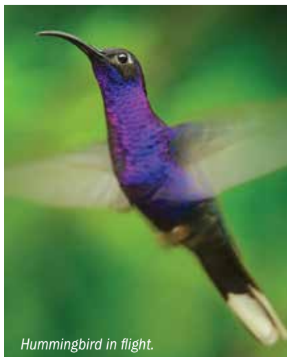
Hummingbird in flight.

After an early breakfast at the hotel transfer to Carara National Park, where the less dense rain forest makes for easy bird sightings. Enjoy lunch at a local restaurant before venturing to the nearby Bat Jungle exhibit or hearing from an early Quaker settler of Monteverde. We'll check into a family-owned retreat with expansive lawns and picturesque views of the cloud forest. (B,L,D)