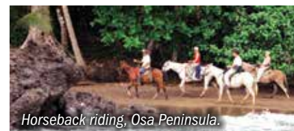
Horseback riding, Osa Peninsula.