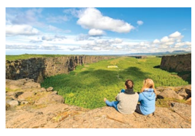
8 Days | From $9,044pp 2025 May-Aug.

Encounter an array of geological wonders: volcanic craters, hot springs, lava fields, and more.