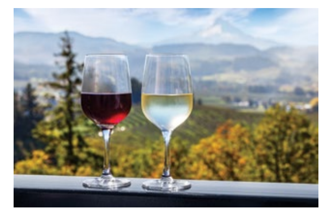
8 Days | From $5,827pp 2024 Sep., Oct. / 2025 Mar., Apr., Sep., Oct.

Sail the Pacific Northwest and enjoy nightly wine tastings curated by Food & Wine magazine's Executive Wine Editor.