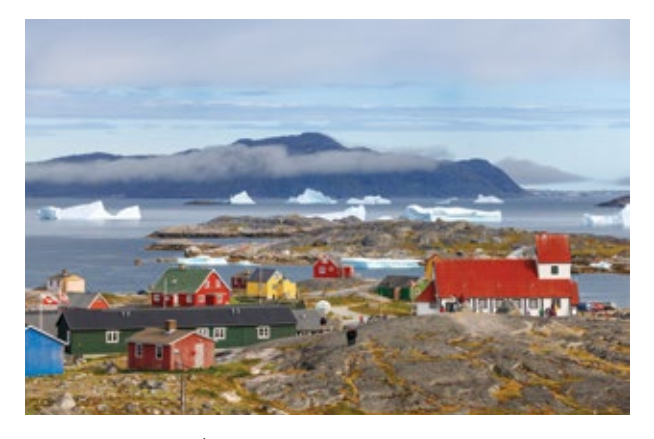
18 Days | From $21,237pp 2024 Aug. / 2025 Jul.

Learn about the rich layers of Greenlandic and Inuit culture at coastal farms and villages.