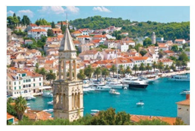
8 Days | From $7,493pp 2025 Jun., Aug.

Capture images of ancient treasures, and document some of the 200 bird species found in Divjakë-Karavasta National Park.