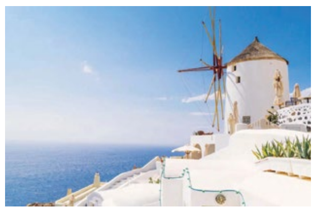
11 Days | From $10,990pp 2025 Jul., Sep.

Explore Turkey and Greece, where the clear blue waters are ideal for kayaking and paddleboarding.