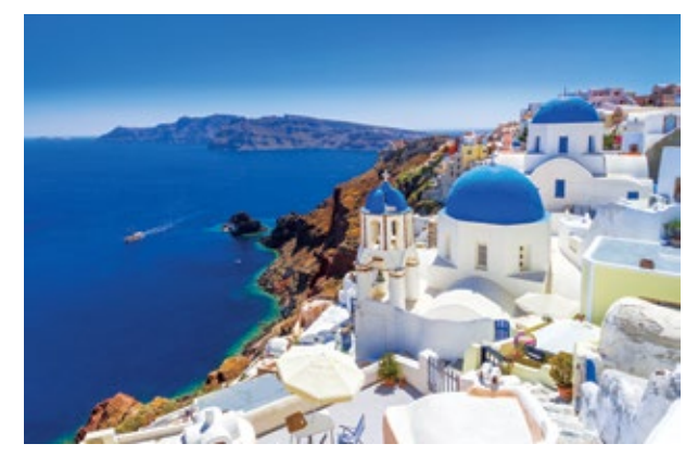
8 Days | From $7,493pp 2025 May, Jul., Aug., Sep.

Set out on foot to discover the sugar-cube villages and serene beaches of the Cyclades.