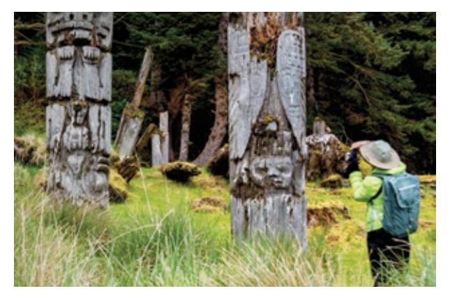
15 Days | From $10,649pp 2024 Apr., May, Sep. / 2025 Apr., Aug., Sep.

Gain special access to the protected ancestral villages of Haida Gwaii.