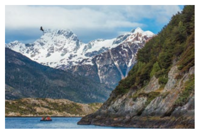
18 Days | From $26,262pp 2025 Jan., Feb., Oct. / 2026 Jan., Feb.

Navigate Chile's spectacular Glacier Alley and seek out iconic Antarctic wildlife.