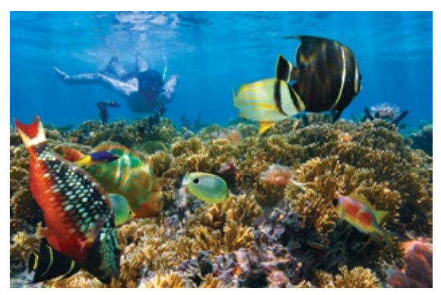
6 Days | From $4,408pp 2024 Nov. / 2025 Jan.-Mar., Nov., Dec. / 2026 Jan. - Mar.

Snorkel crystalline waters and vibrant reefs fed by rich jungle rivers.