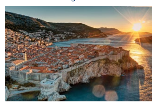
8 Days | From $9,243pp 2025 Aug.

Discover Adriatic traditions, from oystering and cooking to silk embroidery and jewelry-making.