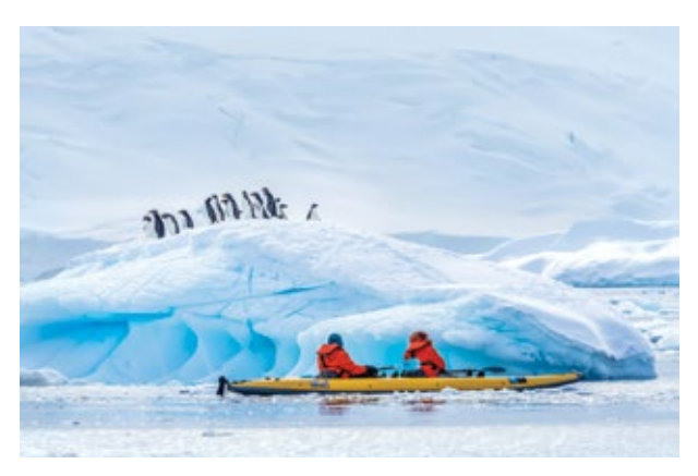
10 Days | From $12,061pp 2024 Nov., Dec. / 2025 Jan., Feb., Nov., Dec. / 2026 Jan., Feb.

Drift through icy stillness pierced by penguin squawks and seal barks.