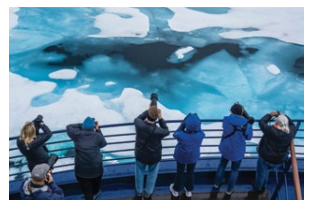
23 Days | From $46,857pp 2025 Aug.

Document the wild, icy wonders found along this legendary route.