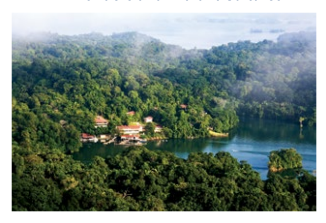
8 Days | From $7,389pp 2025 Dec. / 2026 Jan.

Spot sea turtles and colorful fish while snorkeling off pristine, palm-fringed beaches.