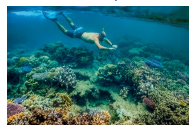
11 Days | From $11,265pp 2024 Aug.

Swim or scuba dive* in warm waters and explore tropical reefs and undersea gardens.