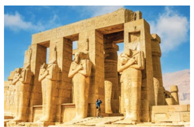
12 Days | From $14,162pp 2024 Sep.-Dec. / 2025 Jan.-Mar., Sep.-Nov.

Get a unique angle on iconic pyramids and temples painted with vibrant hieroglyphics.