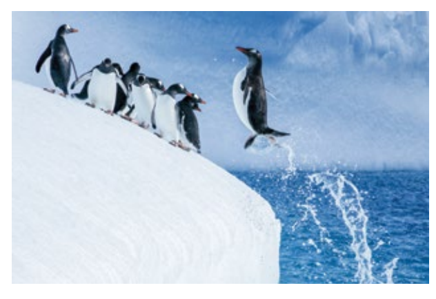
8 Days | From $11,975pp 2024 Nov., Dec. / 2025 Jan., Feb., Nov., Dec. / 2026 Jan., Feb.

Fly to the White Continent and explore on kayaking, hiking, and Zodiac excursions.