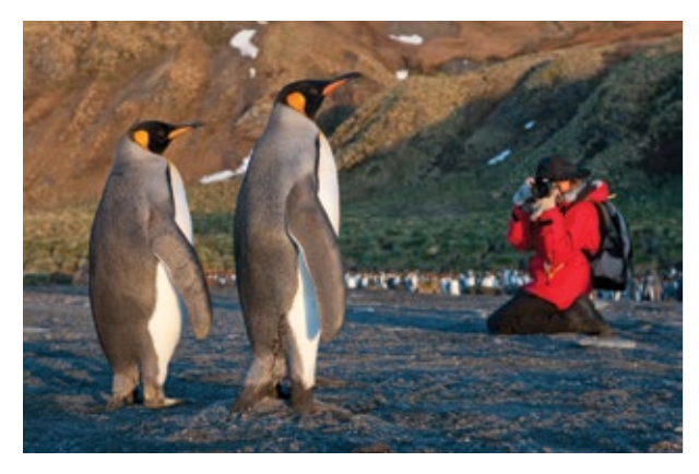
17 Days | From $25,971pp 2024 Oct. / 2025 Mar.

Train your lens on massive colonies of king penguins, elephant seals, and albatrosses.