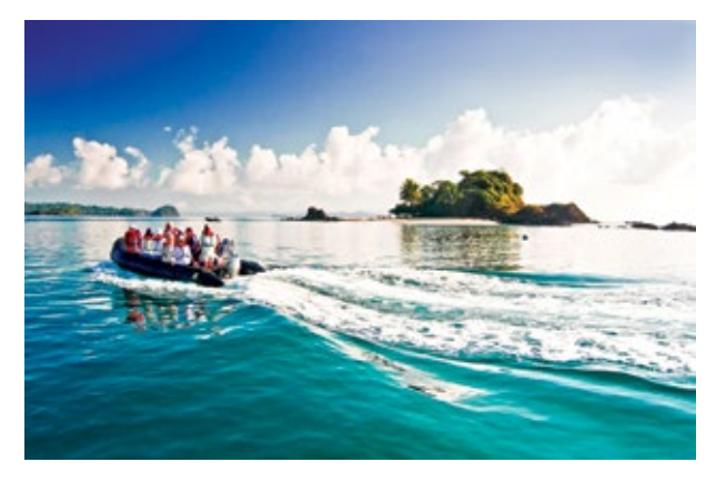
8 Days | From $7,173pp 2024 Nov., Dec. / 2025 Jan.-Mar., Nov., Dec. / 2026 Jan.-Mar.

Float along jungle rivers in search of spider monkeys and sloths, and transit the Panama Canal.