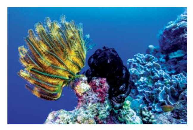
13 Days | From $11,362pp 2025 Jan.

Explore fascinating shipwrecks and vibrant reefs on snorkeling and diving excursions.*