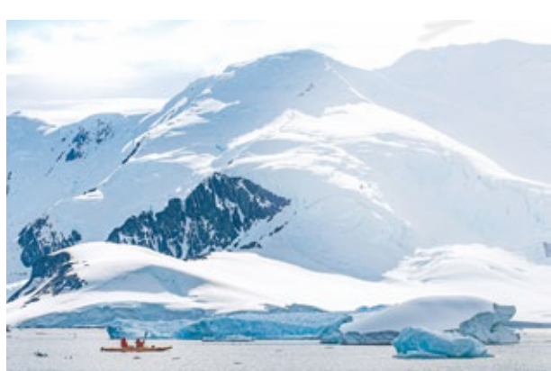
12 Days | From $16,980pp 2024 Nov., Dec. / 2025 Jan., Feb., Nov., Dec. / 2026 Jan.

Kayak in the most epic place on Earth: the icy waters of Antarctica, home to whales, penguins, and leopard seals.