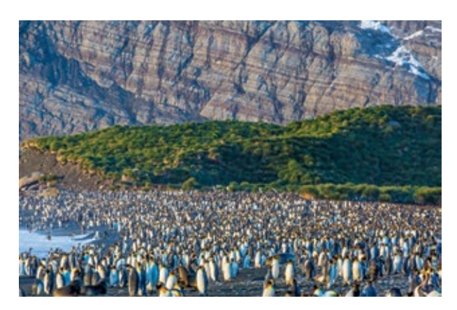
25 Days | From $44,746pp 2025 Oct.

Walk amid scores of king penguins and elephant seals on shores only accessible by small craft.