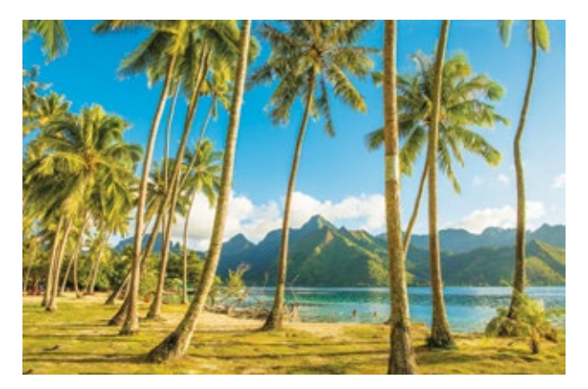
10 Days | From $10,910pp 2025 Jan., Feb.

Float through an otherworldly grotto, snorkel protected reefs, and scuba dive* in Polynesia's turquoise lagoons. *Scuba diving is available at an additional cost.