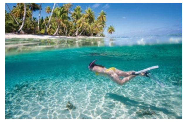
17 Days | From $16,570pp 2025 Jan.

Scuba dive* or snorkel among underwater canyons and tunnels formed from lava.