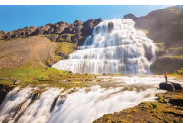
12 Days | From $18,412pp 2024 Jul. / 2025 Jul., Aug.

Explore western Iceland's secluded waterfalls and soaring fjords.