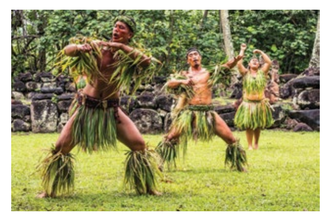
10 Days | From $12,488pp 2025 Feb.

Encounter giant tikis, thousand-year-old petroglyphs, and ancient maraes , or sacred sites.