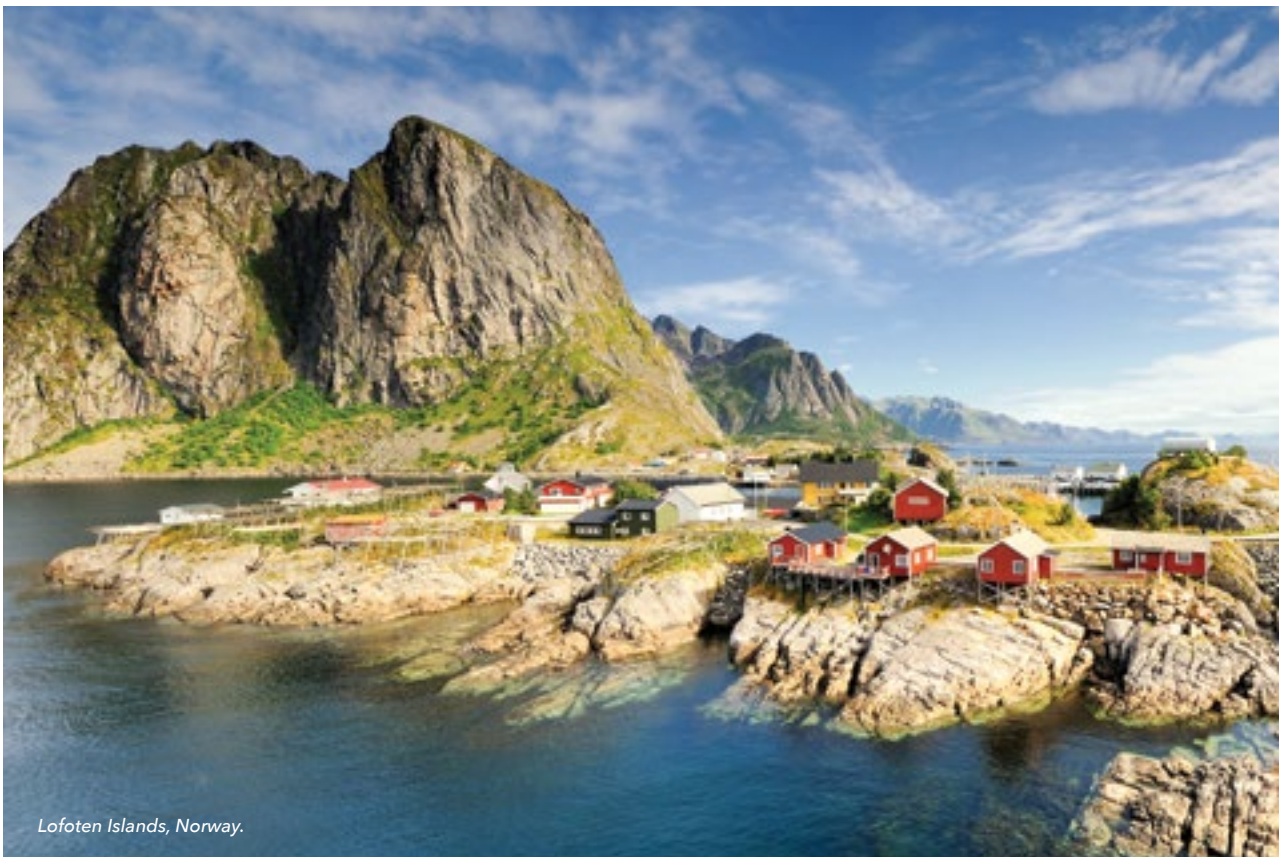
Lofoten Islands, Norway.

SPECIAL OFFER: Book by Nov. 1 to lock in current rates on all 2026-2027 departures. Plus, additional early booking offers available. See page 30 for details.