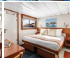
Clockwise from top: Lounge with full service bar and facilities for films, slideshows and presentations; Category 3 cabin; Dining room offering single seating meals and an informal atmosphere.