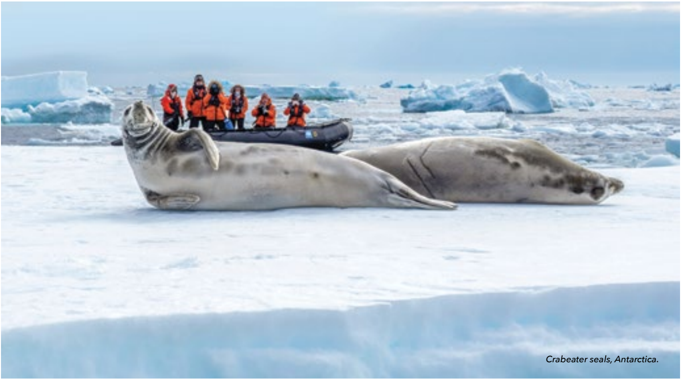
Crabeater seals, Antarctica.