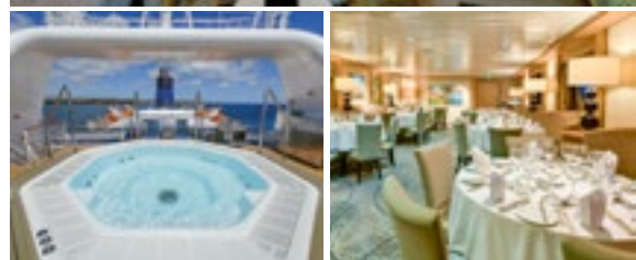
Clockwise from top: Category 6 suite; dining room; upper deck with whirlpool hot tub.