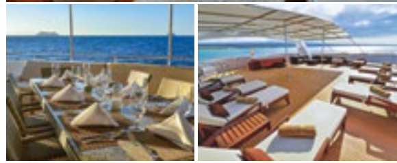
Clockwise from top: Category 4 stateroom; Observation Deck; Outdoor Cafe.