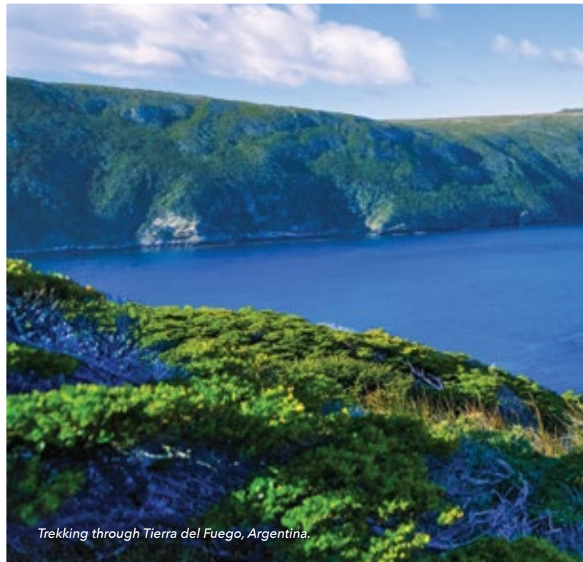
Trekking through Tierra del Fuego, Argentina.

ALL IN: Activities and excursions are always included in the voyage price unless otherwise noted.