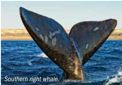
Southern right whale.

After a day at sea, dock in Bahia Blanca and head to the Parque Provincial Ernesto Tornquist to view the flora and fauna of the pampas . Another day of sailing brings us to Peninsula Valdés, a World Heritage Site where southern right whales come to mate and give birth. Observe these endangered creatures and then venture inland to spot guanacos, Patagonian foxes, and more. (B,L,D Daily)